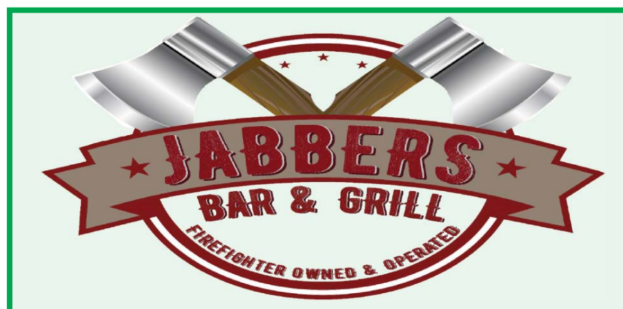
Pardon our Dust as we make some New & Exciting Changes!

Bring the whole family and be ready to spend the whole day and have a good time. Everyone is welcome.